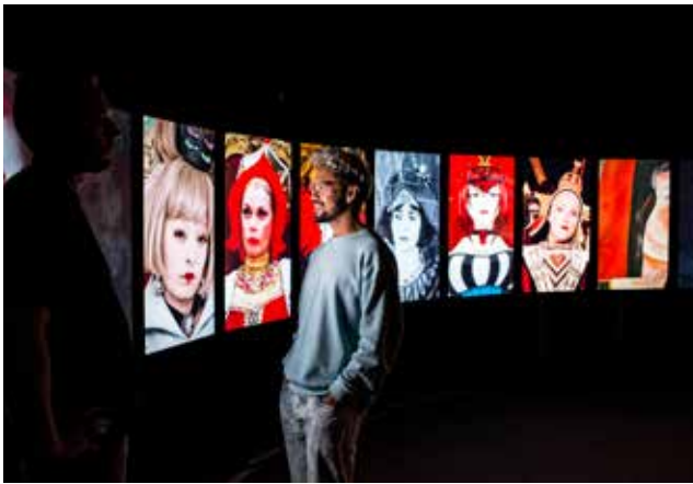
Wonderland, ACMI, Photo: © Phoebe Powell

Admission is free on a first-come-first-served basis, subject to availability.